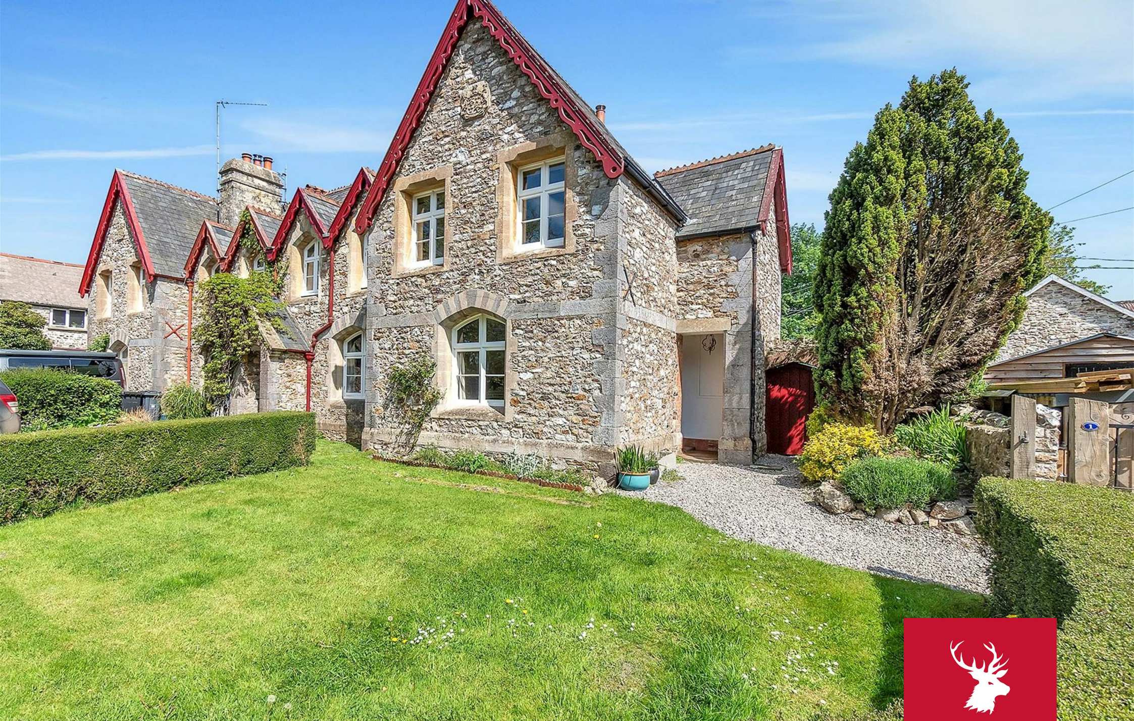
1 Addington Cottages